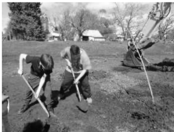
Figure 4. RVES students help bury cottonwood pole to make sure there is no air pockets in soil.

Rolinda Want. These trips include visits to the Wildlands Conservancy at the Eel River Preserve where students can look at plants in bloom in an area that was traditional Wailaki territory, in particularly, Rice Lake, where Wailaki peoples had camp in the summer. Lourance also talked about a hike up to Cahto Mountain, where students will meet with BLM foresters to learn about restoration, as well as an overnight trip to Usal, on the coast b/w Westport and Leggett, to learn about erosion, fuel reduction, carbon sequestration, using native grass for restoration, and even do an owl night hike. Additionally, Lourance talked about shorter in-town