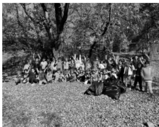
Figure 7. RVES second graders celebrating a successful Town Creek clean up. 10/27/23.