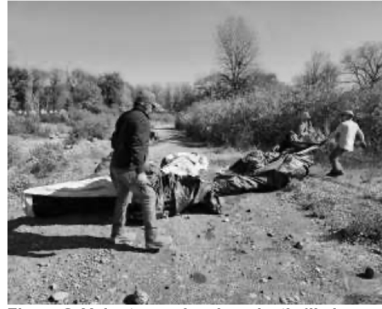
Figure 8. Volunteers cleaning plastic likely from cannabis greenhouse. 10/28/23.

to help with chaperoning field trips; there’s also the possibility of field trips like these specifically for adults. If you’re interested, you can contact her at (707) 972-3637 to volunteer or learn more about the innovative and important events and opportunities to engage with the Eel River Recovery Project.