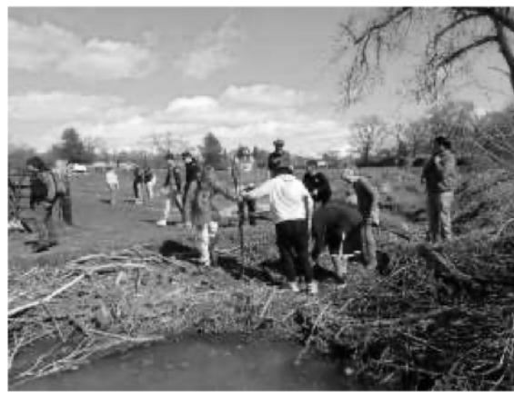
Figure 5. RVHS students planting willow stakes under direction of Stephanie Tebbutt. 3/10/23.

at the elementary, middle and high schools will obtain—that is, they will clean up trash!—and recycle/reclaim pieces to make works of art for the Round Valley Earth Day Celebration. Patience Gruey is the point person, leading the vision for creating a large bear sculpture together with the high school art class; middle school and elementary classes will create their own art as well to compose the smaller elements and components of the sculpture, such as foliage and fish. The ERRP is also collaborating with the high school in facilitating field trips for students in the Natural Resources and Native Language / Native Art & History classes led by Amanda Britton and