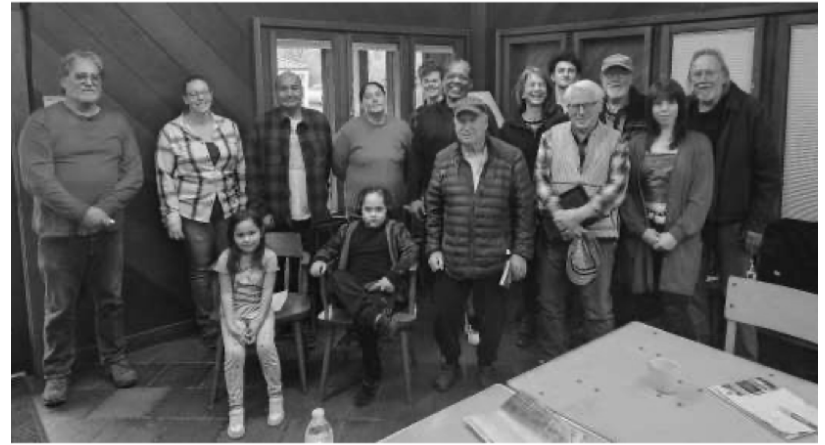
Round Valley Education Committee meeting attendees. January 21, 2024.

spoke about a DIY-approach, where landowners can help combat erosion effectively with plug-in willows, and, how the traditional use of willows and valley dogwood for basket making and arrow crafting, underscore the cultural significance intertwined with restoration efforts in Round Valley. Lourance also shared some exciting plans for an Earth Day art show funded by a grant she secured from the Mendocino Community Foundation. The art show, scheduled for April 19th, aims to raise awareness about environmental issues and recycling through creative expression. Students